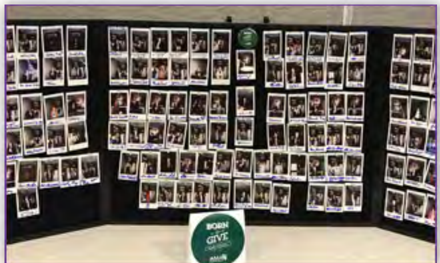
Celebrating all our amazing donors at the meeting.

We were humbled by this outpouring of generosity, which allowed us to exceed our fundraising goals and propel us into the year ahead.