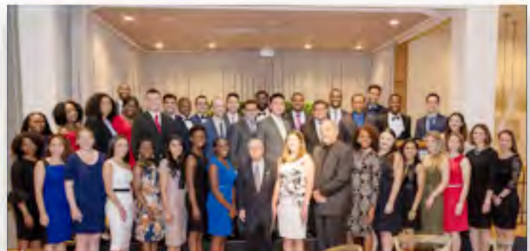
Award recipients were honored at the 2017 Excellence in Medicine Awards Ceremony