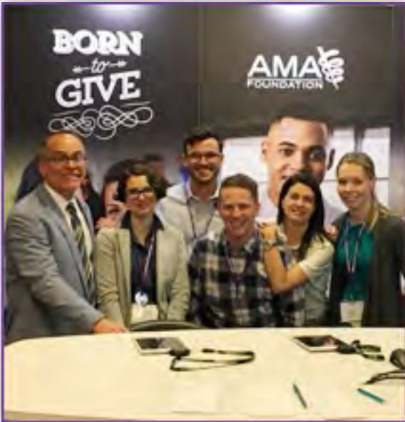
Members of the AMAF team read for a great meeting.

Each year, the Foundation takes advantage of the opportunity provided by the American Medical Association's House of Delegates meeting, which brings together thousands of physicians. It is the ideal setting to personally engage with many of our donors to update them on our programmatic impact and thank them for their support.