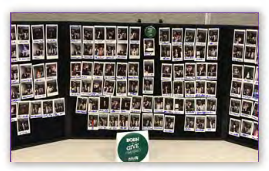
Celebrating all our amazing donors at the meeting.

We were humbled by this outpouring of generosity, which allowed us to exceed our fundraising goals and propel us into the year ahead.