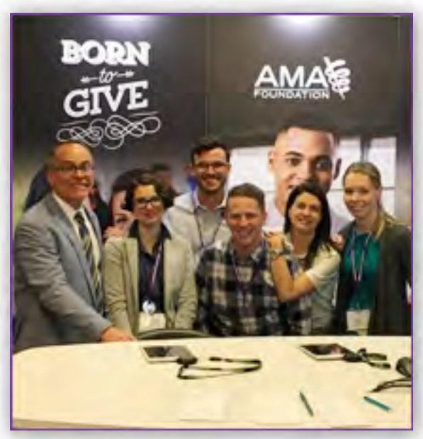
Members of the AMAF team read for a great meeting.

Each year, the Foundation takes advantage of the opportunity provided by the American Medical Association's House of Delegates meeting, which brings together thousands of physicians. It is the ideal setting to personally engage with many of our donors to update them on our programmatic impact and thank them for their support.